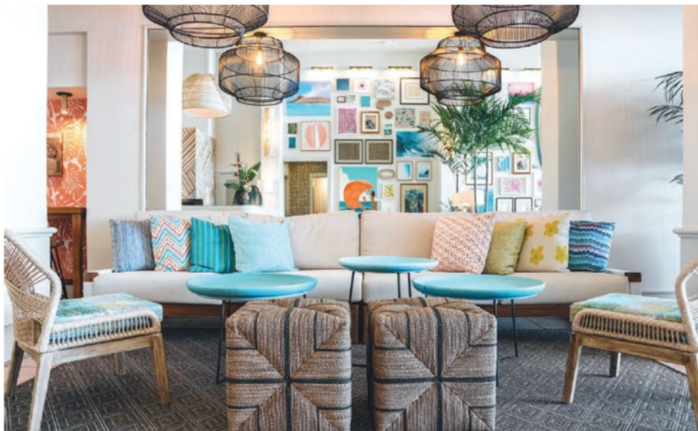
Clockwise from top: Teak woods and oversize woven basket lighting accent the redesigned lobby at Kaimana Beach Hotel; enjoy private dining at Treehouse; tour Maui with a Vintage Cruising experience through Hotel Wailea; avocado toast, the housemade pastry tray and papaya on Hau Tree's new menu. Opposite page: Hotel Wailea's serene pool.